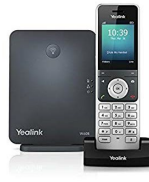
Yealink DECT Cordless